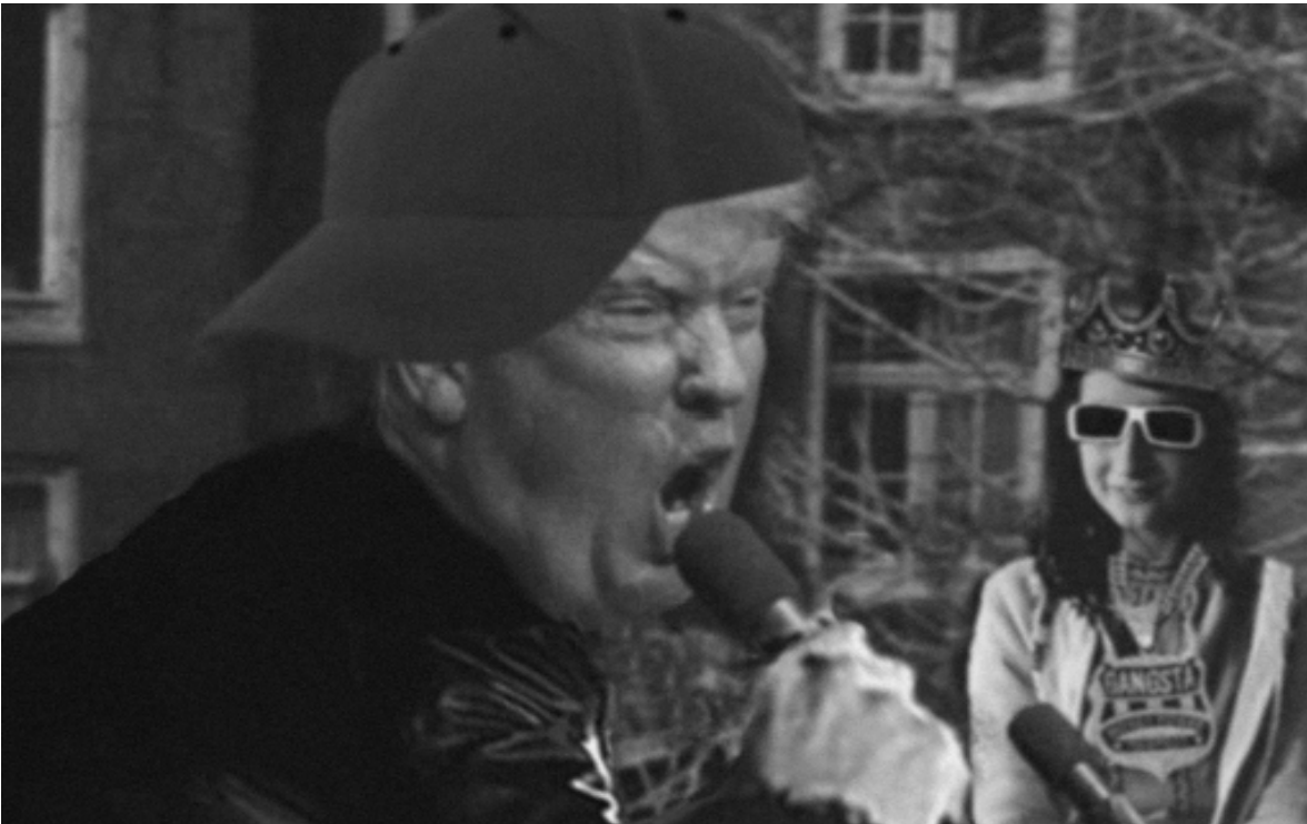
Top secret MI6 photo: Trump vs. Frank begins. The historical rap battle shows a confident Frank and challenger.

We do know a rap battle between Anne Frank and Donald Trump did take place as she was transported into the future with him, but the NSA and White House refuse to confirm or deny if these recordings exist. Washington Post sources insist they have seen them, and that "Anne Frank made Donald Trump cry as well, just ripped him to shreds about his tiny hands or something. It was a draw, I think. He hit her on her diary's little 'period piece,' in reference to her writing about getting her first period and he ripped on her hard. It staggered her.